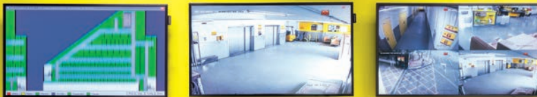
Archive multi pack.