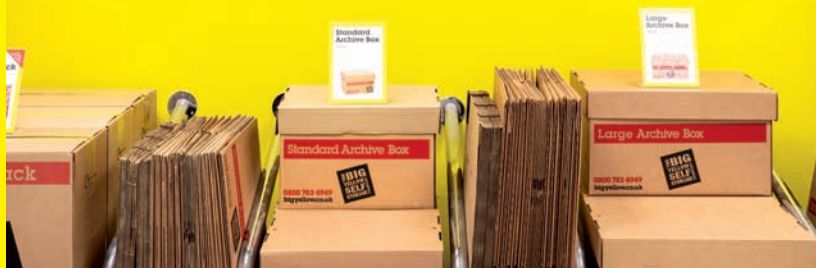
Large archive box.