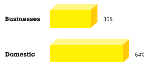
Average space occupied by customer type